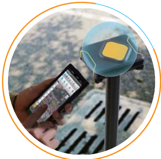
Mobile Phone Professional surveying pole