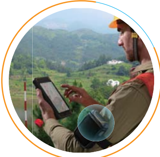
Tablet Flexible wear mode