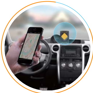
Vehicle Navigation application