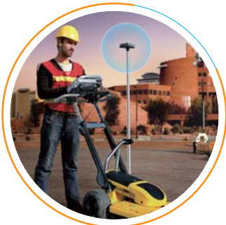
Sensor equipment Integrated as a sensor